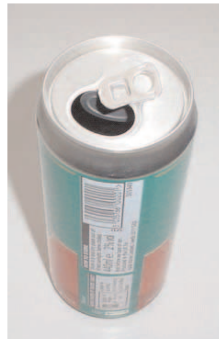
Metal drinks can